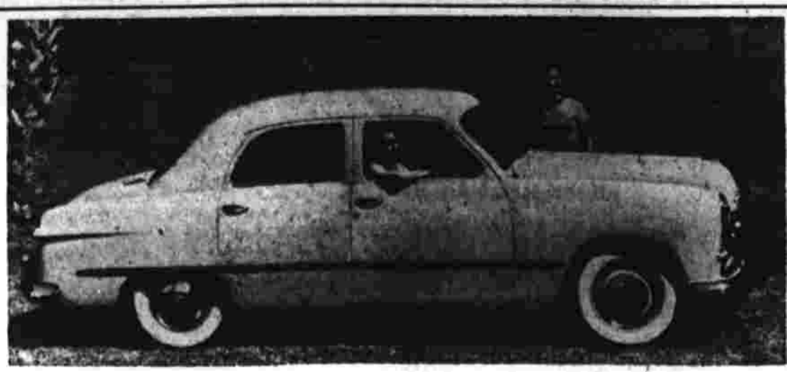
The revolutionary new Ford four-door sedan for 1949 is lower, wider, roomier and provides nearly 25 per cent more visibility.

Instead of down to open the door. This eliminates the possibility of the car doors swinging open if the handle should be pressed down accidentally. The new Ford's functionality has been extended to the roomy seats—37 inches wide in front and 60 inches in the rear, plenty of room for six persons. New windows demonstrate the new trend. The rear window alone is 88 per cent larger—so large as to give a picture window effect to the ordinary windshield. The windshield is deeper and wider. They give a picture window effect to the entire car and greatly improve all around visibility.